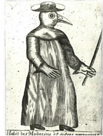
An image of a Doctor during the Black Death.