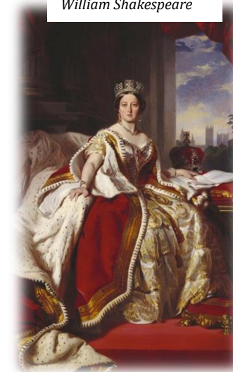
Queen Victoria in her Coronation robes.