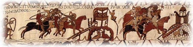
The Bayeux Tapestry depicting the Battle of Hastings.

1859: Charles Darwin publishes Origin of Species