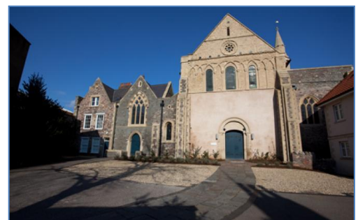
St James Priory